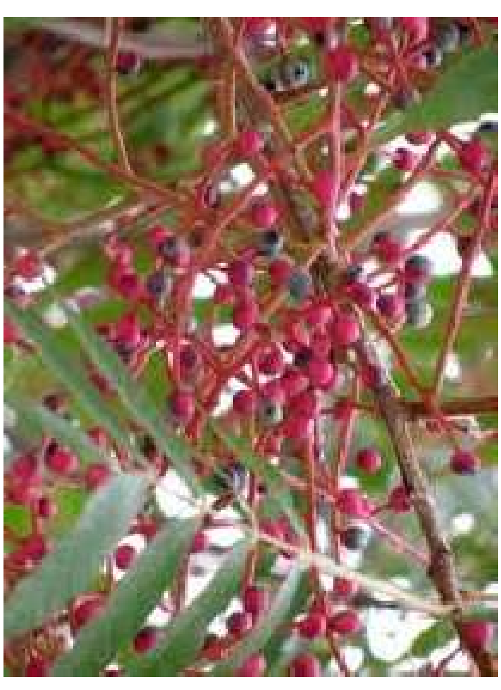
Female Trees Produce a Small Round Nut Birds Love.