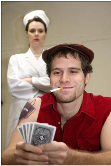
A scene from the upcoming production of "One Flew over the Cuckoo's Nest." See the calendar section for exact times and dates.